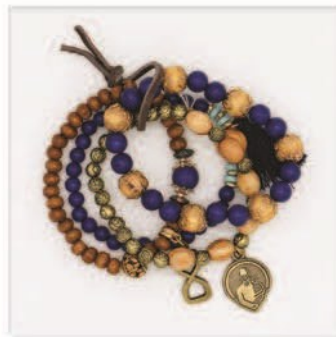
Stretch Bracelets, set of 4 (2 plate charms) · $50