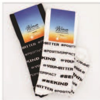
Navy or White Cotton Crew Socks · $25 per pair