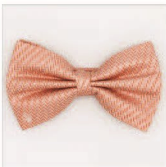
Bow Tie Pre-Tied or Freestyle · $45