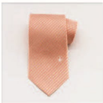
Tie Regular or Extra Long · $45