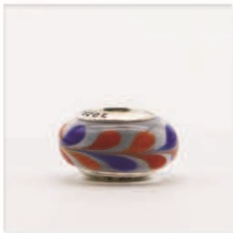
Bead · $45

Women IMPACTING CARE SUPPORTING SHRINERS CHILDREN'S™