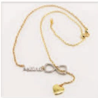
Be Kind Lariat necklace (plate) · $50