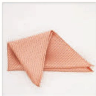
Pocket Square · $25